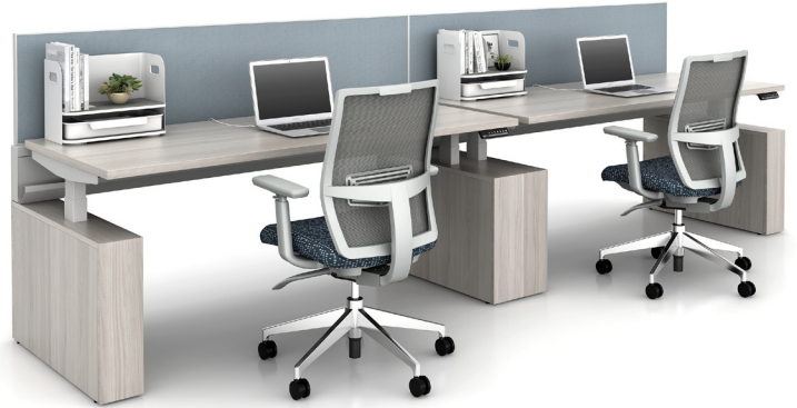
PowerBench one-sided application

PowerBench optimizes space while fostering collaboration among employees thanks to its simple and succinct kit of parts. Whether teams are working side-by-side or individuals are focused on the tasks of the day, the efficient footprint of PowerBench provides all the essentials needed today. Place Day-to-Day tables nearby for swift collaboration, Calibrate lockers for personal storage, and Chatham Cove Work Lounge for private, heads-down work. Our broad product offering provides many choices to support the varied needs of users today.