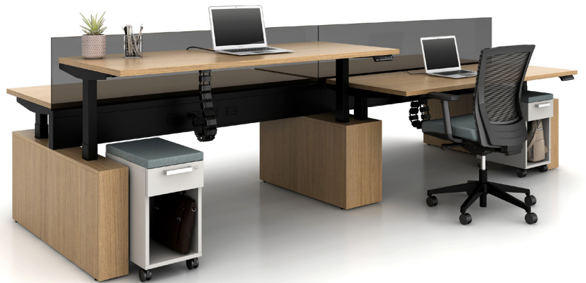
PowerBench two-sided application highlighting powered spine