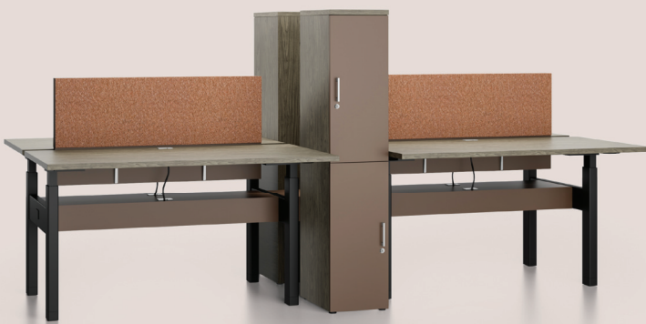
Multiple size storage options available between benching stations

See more at: three-h.com/upside-benching