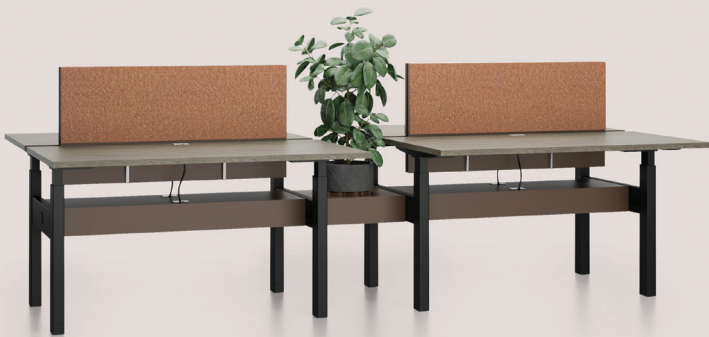
Multiple width spacers between benching stations ranging from 8 - 36 inch