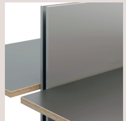
Laminate Privacy Screens (14 & 21 Inch Heights)