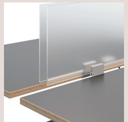
Frosted & Clear Acrylic Privacy Screens (14 inch Only)

Designed, Developed and Manufactured in North America. All material and major components sourced within 500 miles of the factory in North America.